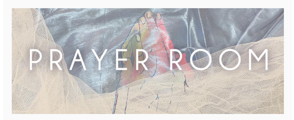
Prayer room is now open!

Meeting Room 2 (blue room) upstairs in the church building has been turned into a prayer room. This is a trial for the space from now until Easter.