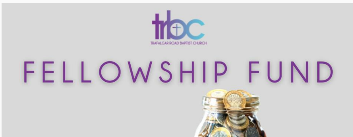
The Fellowship Fund

The next meeting will be on Wednesday 19th June at 7:30pm.