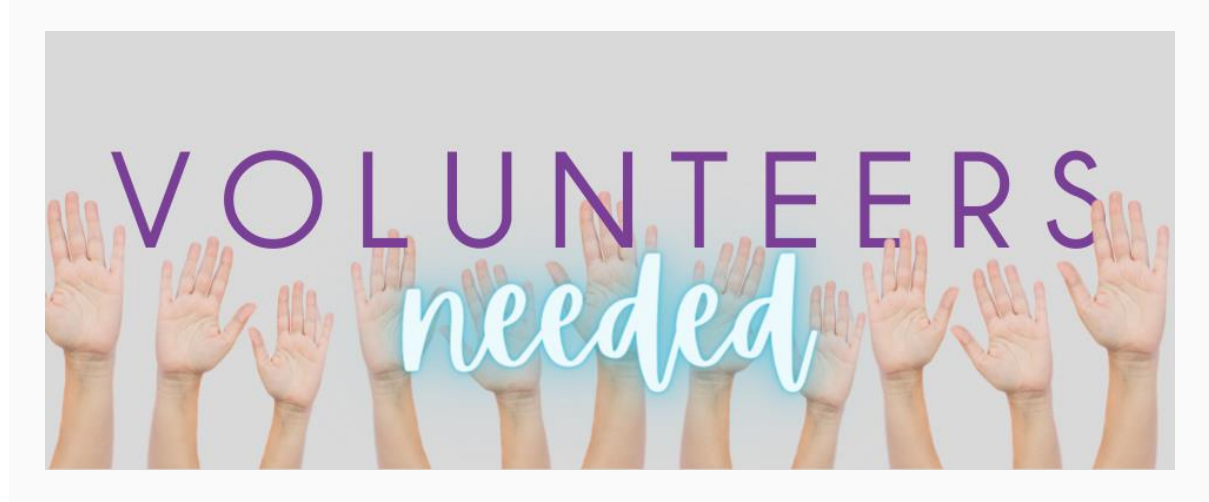
Volunteers for Holiday at Home @ Brighton Road Baptist Church

BRBC are looking for volunteers to help with their Holiday at Home on Tuesday 20th, Thursday 22nd and Friday 23rd August.