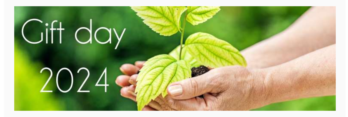
Gift Day 2024

Your company is the best gift, no presents please - there will be an opportunity to donate to myaware (Myasthenia Gravis Association) on the day