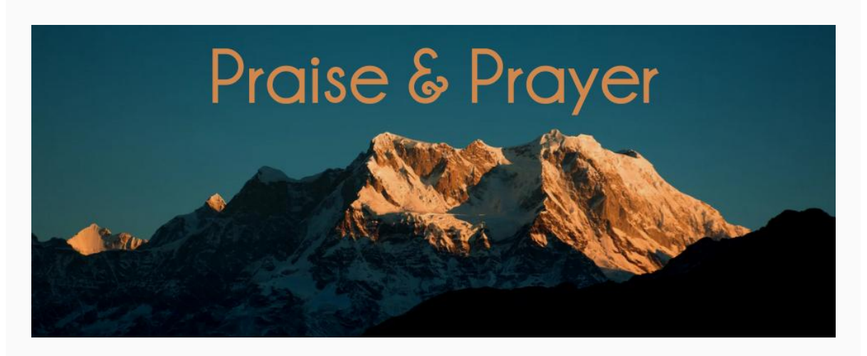
Praise & Prayer points for this week...

SEBA Church of the Week: Forest Row Baptist Church