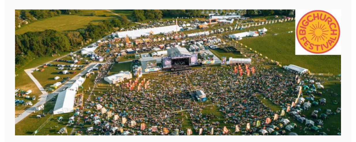
Big Church Festival

22nd - 24th August, Wiston Estate, West Sussex