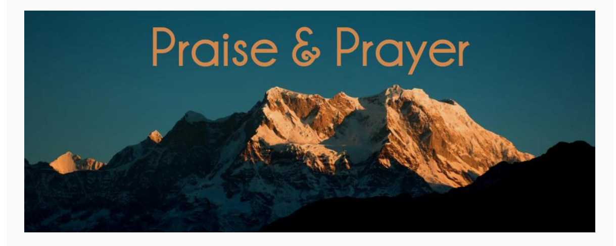
Praise & Prayer points for this week...

Mon 19th: Thank the Lord for what you heard in church yesterday. Ask Him to help you