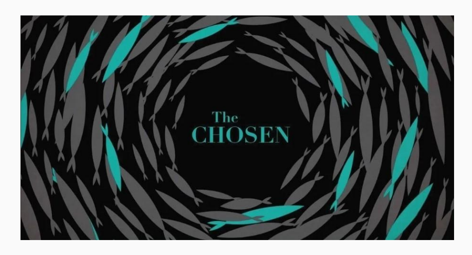
The Chosen Feedback

Do you love 'The Chosen'? How has it affected you? Do you have a favourite episode or moment?