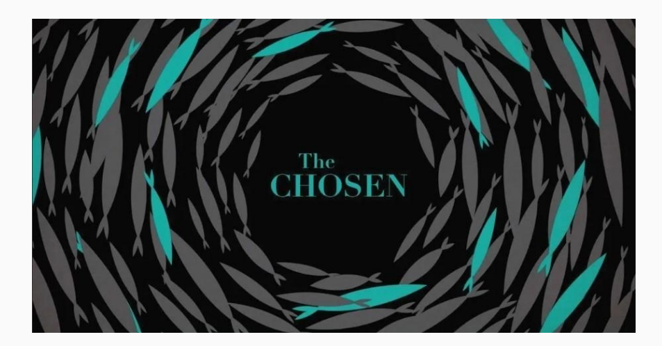
The Chosen Feedback

For more info visit the 24-7 prayer website.