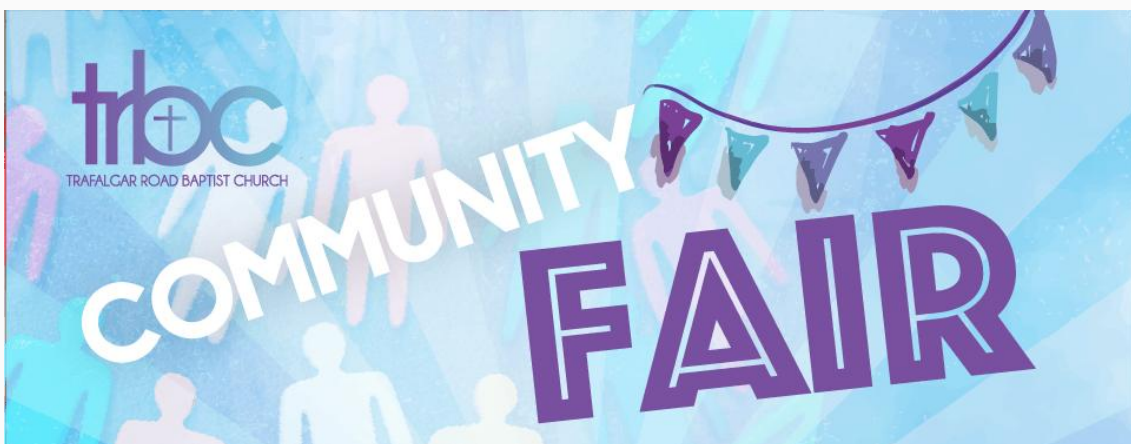
TRBC Community Fair